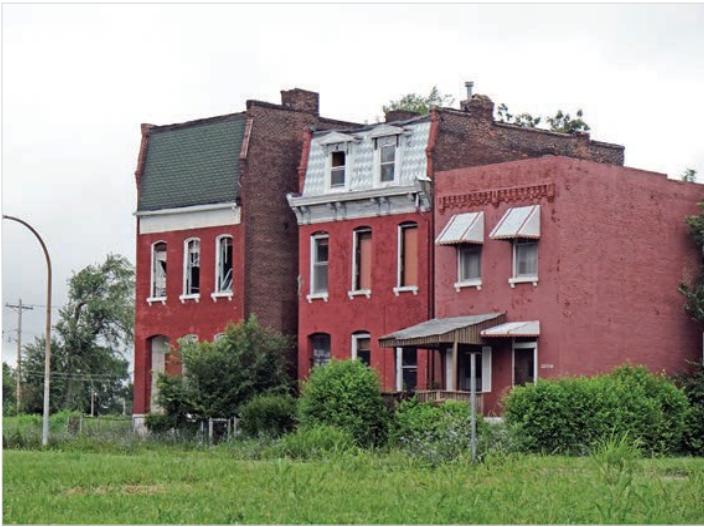
Pictured: The Near North Side is peppered with unoccupied residences, warehouses, and commercial buildings (left), but recent investments are positioning the neighborhood for success. The Flance Early Learning Center, for example, is a preschool for children ages 6 weeks to 6 years that provides high quality early childhood education to children from all households regardless of income (right).